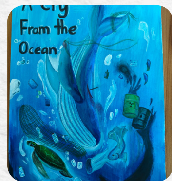
Xuan Xuan's Poster