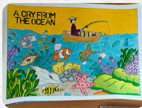
Jiareet's Winning Poster