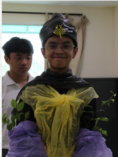
Our students proudly dressed in beautiful Hari Raya cultural attire, celebrating diversity, unity, and the vibrant spirit of our school community.