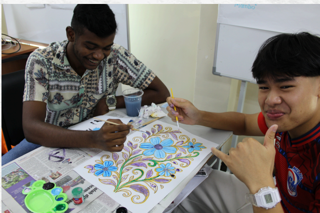
Students were fully engaged in their batik colouring activity, adding vibrant colours as part of our Hari Raya celebration.