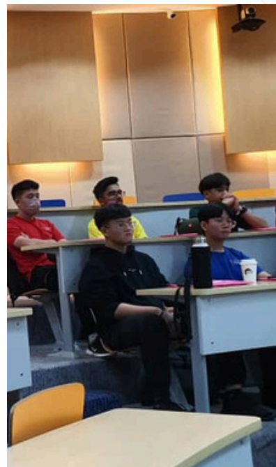
BUILDING ASPIRATIONS AND GOALS

In an exciting educational initiative, Year 9, Year 10, and Year 11 students from UUM International School Melaka are set to embark on an enriching visit to Sunway University and Monash University campuses in Kuala Lumpur.