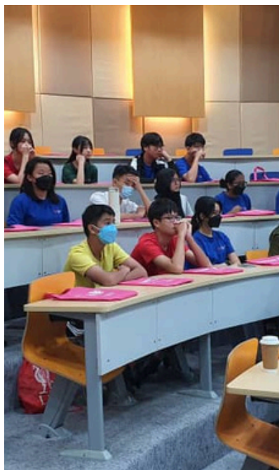
A GLIMPSE INTO FUTURE EDUCATIONAL OPPORTUNITIES