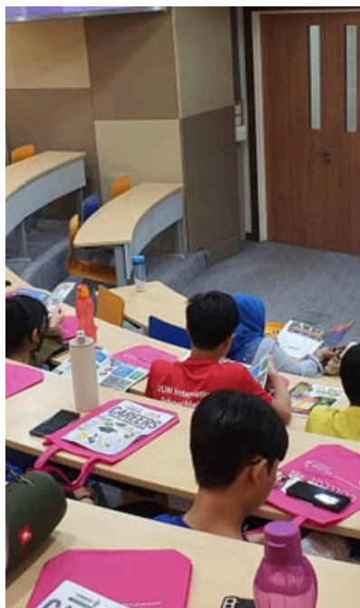
EXPLORING SUNWAY UNIVERSITY